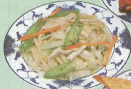
Chicken Chow Mein