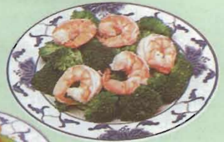
Shrimp w. Broccoli