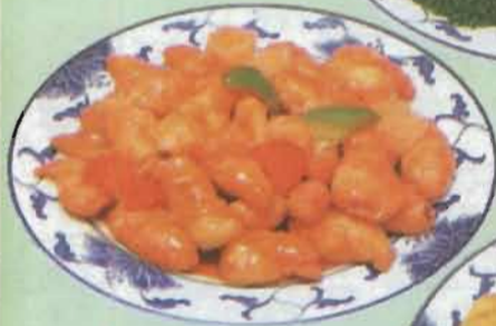
Steamed or Fried Meat Dumplings (6)