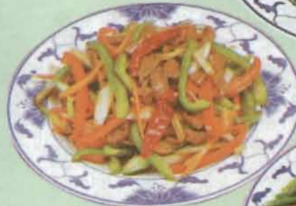
String Beans w. Beef