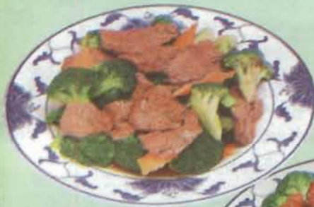
Beef with Broccoli