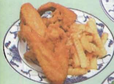
Chicken Wing w. French Fries