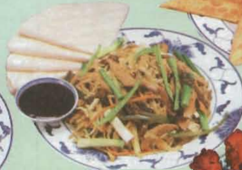
Moo Shu Pork